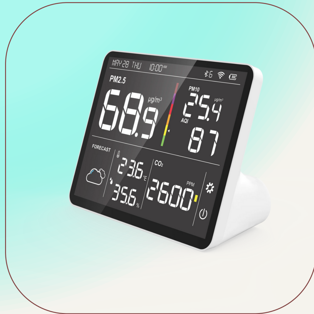
Environmental Monitoring System