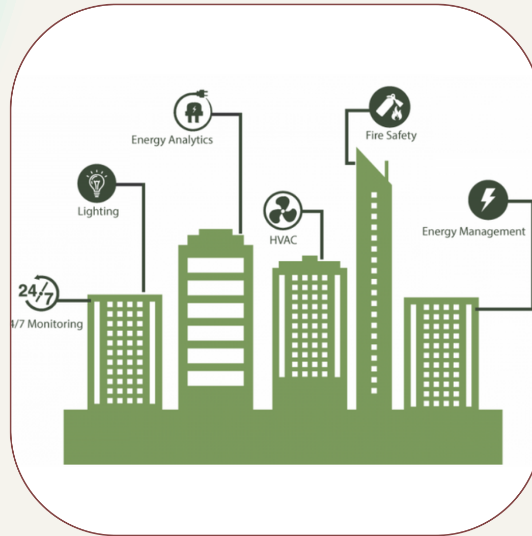
Building Monitoring System