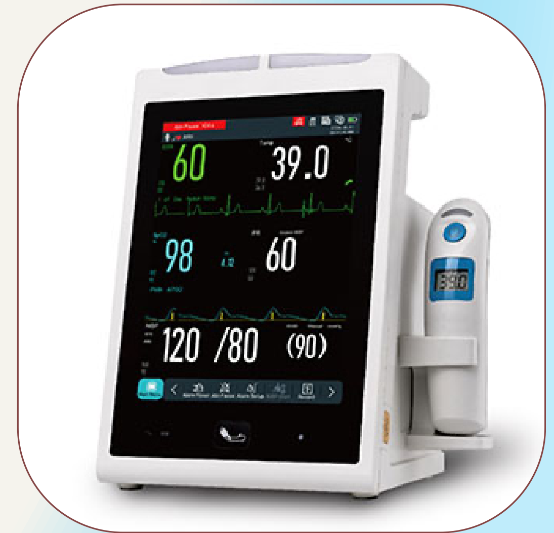
Health Monitoring System